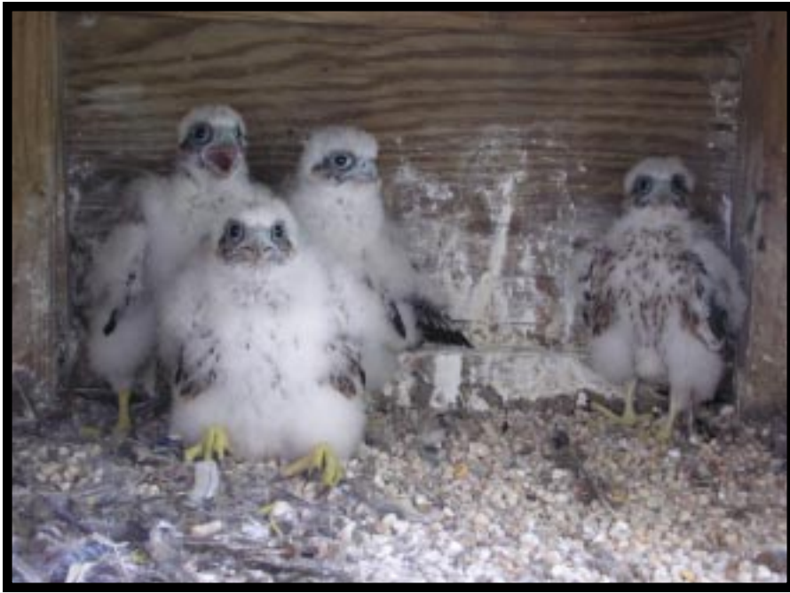
Chicks in nest box on the Benjamin Harrison Bridge.