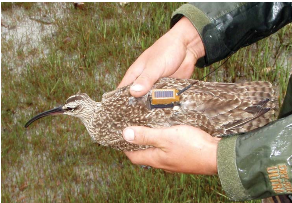
Fig. 1. Platform Transmitter Terminal (PTT) attachment on a Whimbrel that was captured along the lower Delmarva Peninsula in Virginia on 20 May 2008. Note neoprene base, Teflon® harness, and brass rivet used for PTT attachment and PTT position on synsacrum.

The bird was located using satellites of the National Oceanic and Atmospheric Administration and the European Organization for the Exploitation of Meteorological Satellites with onboard tracking equipment operated by Collecte Localisation Satellites (CLS America, Inc., Largo, MD) (Collecte Localisation Satellites 2008, Fancy et al. 1988). The