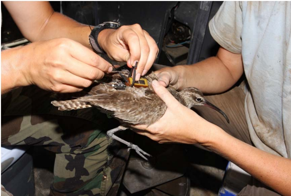
Machi being fitted with satellite transmitter in August, 2009.