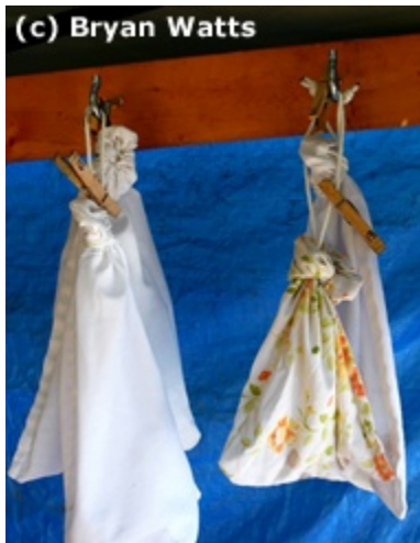
Figure 3. Birds hang in cloth holding bags waiting to be banded and processed.