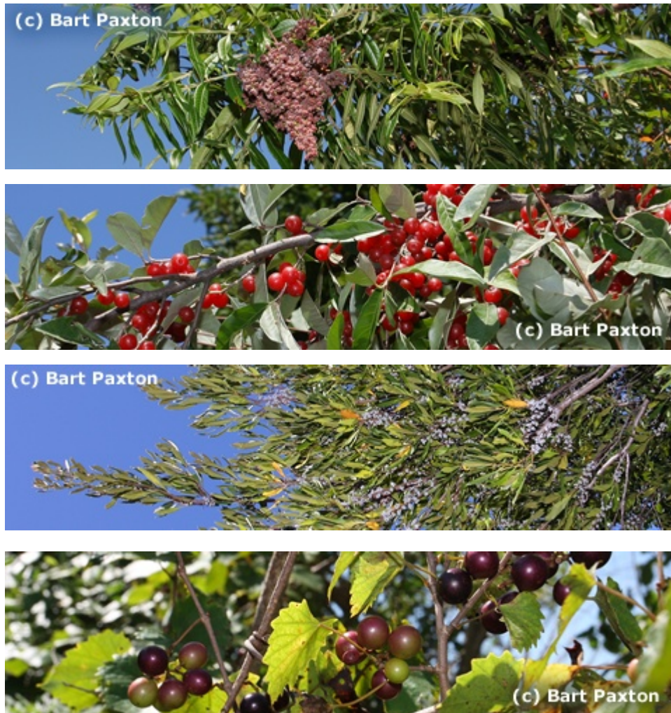
Figure 5. Shrub-scrub layer mast crops on the lower Delmarva Peninsula provide cover and food for fall songbird migrants. Common shrub-scrub level plants on the Delmarva include: (photos, top to bottom) winged sumac, Autumn olive, wax myrtle, scuppernong grape vine. Vegetation surveys were conducted by USFWS technicians in both 2009 and 2010.