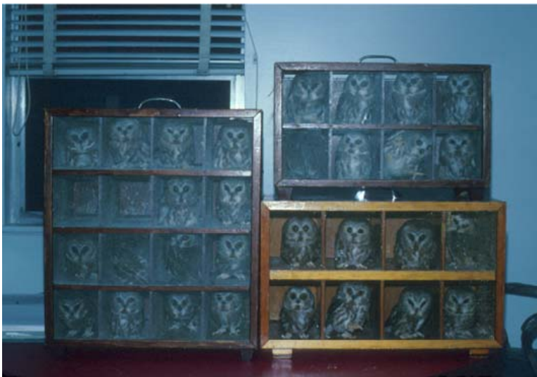
Photo of holding boxes used for transporting owls for processing.

Banding began on 25 October 2010 and continued nightly, weather permitting, until 15 December 2010. Nets were opened at a half hour after dusk and closed at a half hour before dawn. Net checks were conducted every three hours thereafter. A net check consisted of driving to all of the stations in the order in which they were opened and checking the nets for captured owls. All owls were placed in a holding box until processed. Until 2006, owls were processed at the College of William and Mary field house, located on the Eastern Shore of Virginia NWR. Since 2006, owls have been processed in the area of the trapping station. After processing, owls were released near the point of capture.