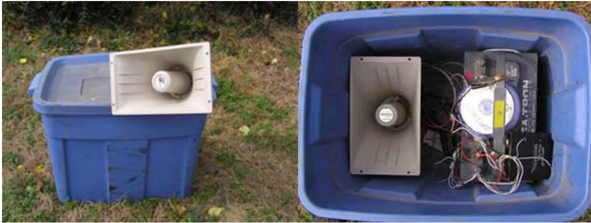
Photos of audio lure components. Photo on left shows components inside plastic container including battery, CD player, amplifier, and bell speaker and connectors. Photo on right shows audio lure in operation with external bell speaker.

Banding began on 25 October 2010 and continued nightly, weather permitting, until 15 December 2010. Nets were opened at a half hour after dusk and closed at a half hour before dawn. Net checks were conducted every three hours thereafter. A net check consisted of driving to all of the stations in the order in which they were opened and checking the nets for captured owls. All owls were placed in a holding box until processed. Until 2006, owls were processed at the College of William and Mary field house, located on the Eastern Shore of Virginia NWR. Since 2006, owls have been processed in the area of the trapping station. After processing, owls were released near the point of capture.