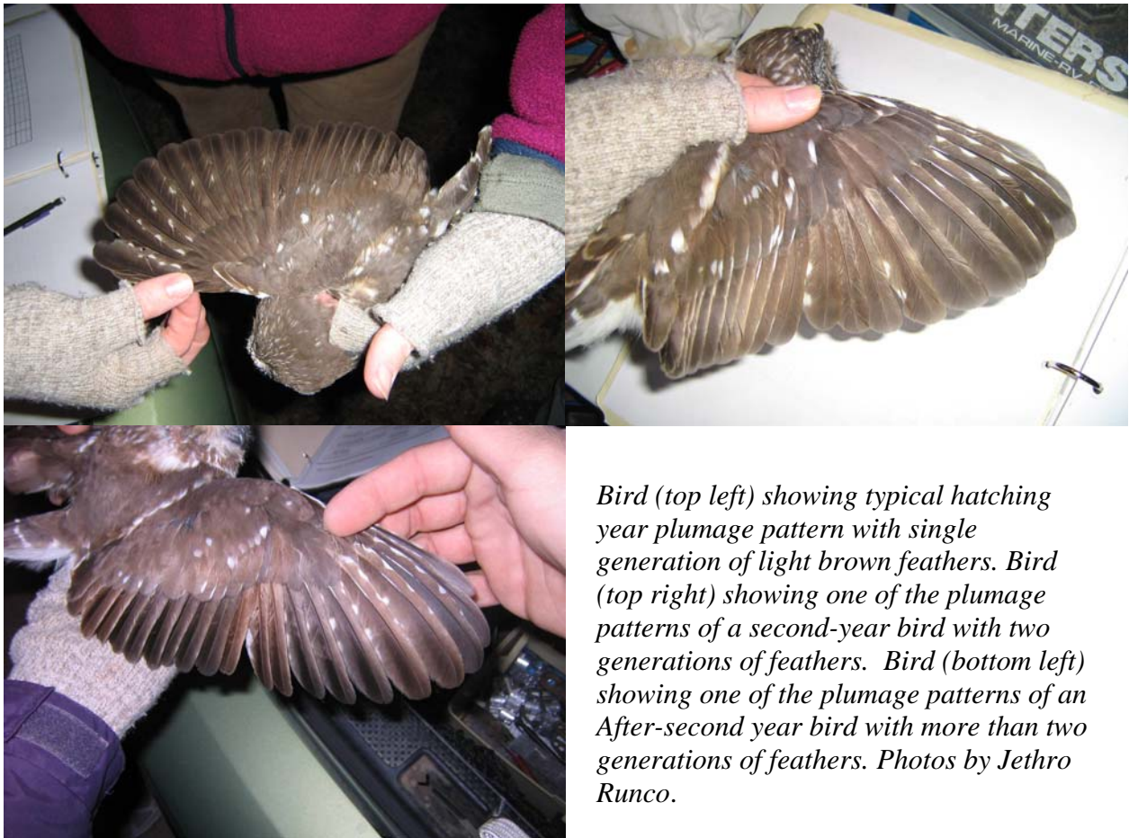
Bird (top left) showing typical hatching year plumage pattern with single generation of light brown feathers. Bird (top right) showing one of the plumage patterns of a second-year bird with two generations of feathers. Bird (bottom left) showing one of the plumage patterns of an After-second year bird with more than two generations of feathers.

Owls were banded with federal aluminum tarsal bands. A standard leg gauge was used to determine proper band size. Natural (unflattened) wing cord measurements were recorded to the nearest millimeter and mass was recorded to the nearest tenth of a gram using an electronic balance. Wings were inspected for evidence of molt to determine age (Evans and Rosenfield, 1987; Pyle, 1997). Northern Saw-whet Owls were aged as hatching-year (HY) if all primary and secondary remiges and coverts appeared uniform in color. They were aged as after-hatching-year (AHY) if primary and secondary remiges were not uniform in color, indicating the presence of more than one generation of feathers. Owls that show only two generations of feather can be further aged as second-year owls (SY), additionally birds with three or more generations of feathers can be aged as after-second-year (ASY) owls (Pyle, 1997).