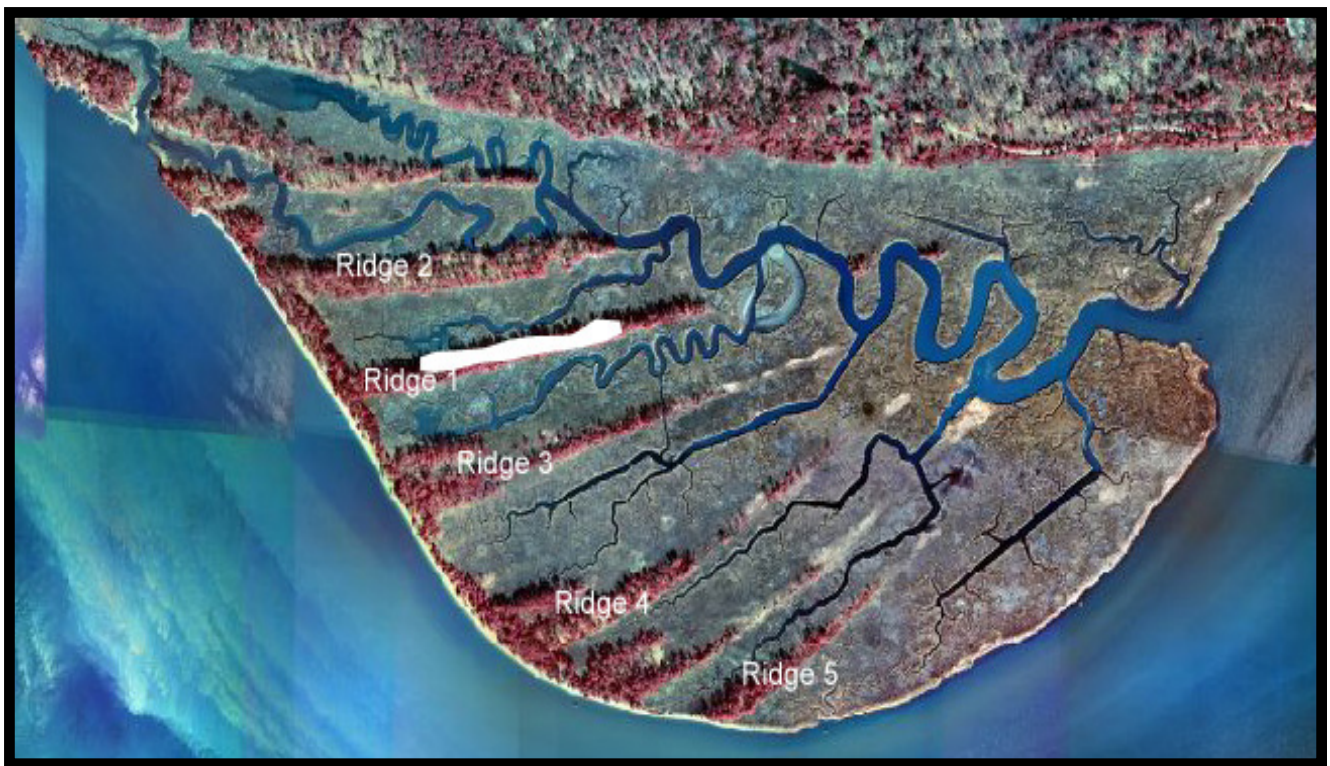
Figure 1. Location of the Great Blue Heron colony on Jamestown Island. Colony boundaries are in white. Ridges 2, 3, 4, and 5 formerly had breeding herons but in 2007 had no nesting herons.

much more greenbrier and a thick wax myrtle shrub layer. Many of the large canopy trees on the ridge died during Hurricane Isabel in the fall of that year. The ridge due west from Ridge 1 has in the past contained heron nests (which we will refer to as Ridge 2). The Ridge 2 habitat is much denser than Ridge 1, with far more greenbrier and wax myrtle than Ridge 1. Ridges 3, 4, and 5 are smaller than Ridges 1 and 2 in both length and width and have a very dense understory layer. The Jamestown colony experienced a small increase in nests from 21 in 2006 to 30 in 2007. Numbers of nests have still declined substantially during the past few breeding seasons (see Table 1.). This is due to a tendency of Great Blue Herons in recent years to nest in smaller, more isolated colonies (Watts, pers. com.). In 2007, the birds occupied 1 of 4 ridges occupied in 2003 and 1 of 3 ridges occupied in 2005.