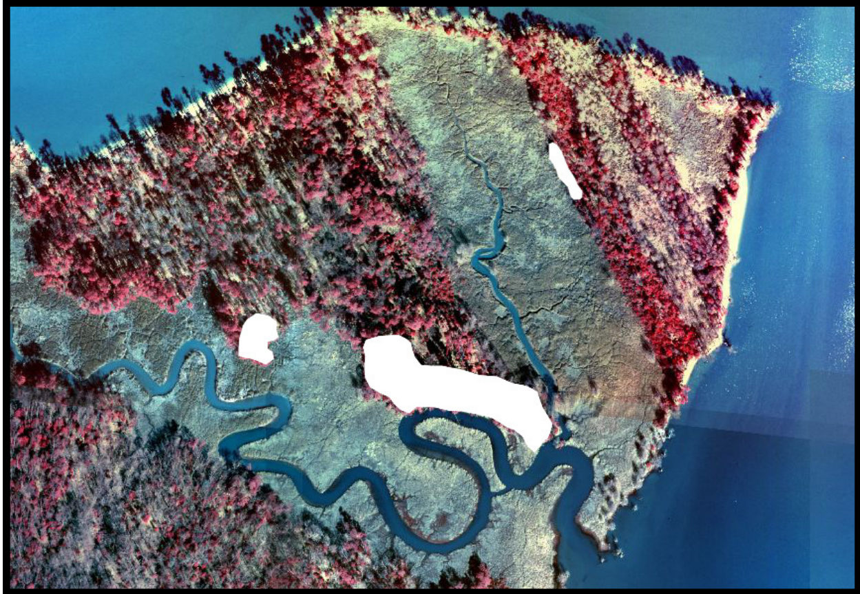
Figure 3. Location of colonies on Swanns Point. Colony boundaries are in white.

Swanns Point Colony: The Swanns point colony declined from 56 nests in 2006 to 34 nests in 2007. The colony has also declined substantially over time as have the other two large colonies (Yorktown and Jamestown). The main colony is still largely centered in the mature pines of Black Duck Gut, but has shifted to the east and encompasses some of the mature bald cypress trees as well. The understory is open and very park like in the pine section of the colony, and quite swampy with an open understory in the section composed of cypress trees. Nests were also found to the northeast of the main colony and directly west of the main colony (See Figure 3 for a map of colony boundaries).