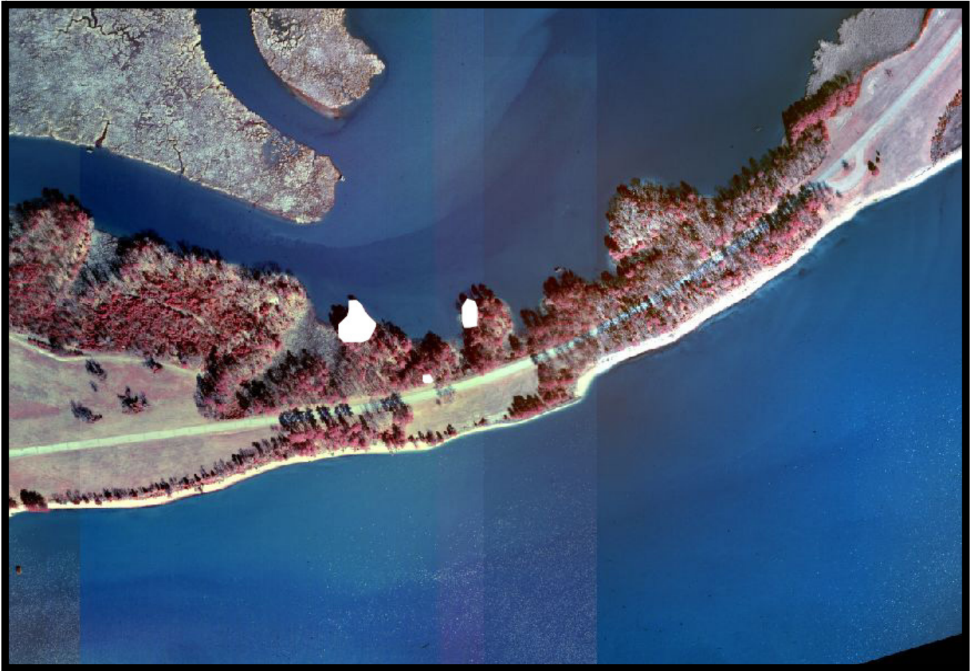
Figure 4. Location of College Creek heronry. Colony boundaries are in white.

College Creek Colony: The College Creek heronry trees were decimated by a major wind event in 2007, and no nests were found this year. At least two and probably more former nesting trees were topped off by this event. The colony was first discovered during the 2000 survey. The former colony was spread across the tips of two shoreline points separated by a small tidal gut (See Figure 4 for a map of former colony boundaries). The site is very near the Colonial National Historic Parkway.